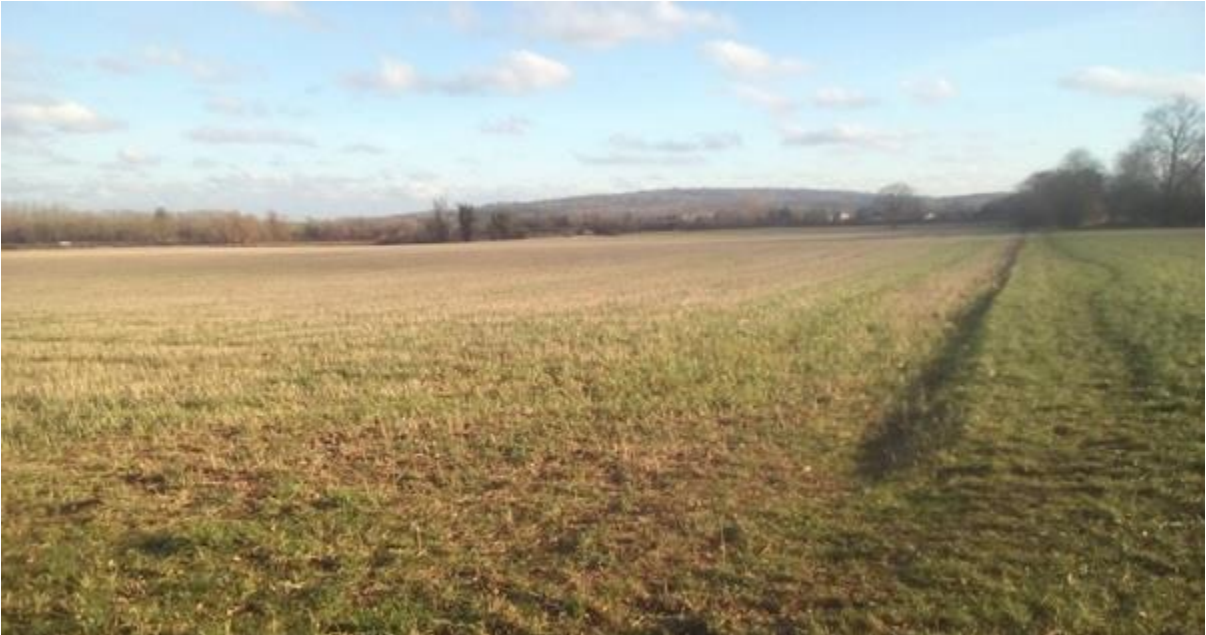
Arable land on the site, looking towards Wytham Hill [EPIC]

Another grave flaw in the planning process was the assessment of the suitability of the proposed garden village site for such extensive development. An earlier document prepared for Oxfordshire County Council (OCC) by Land Use Consultants (LUC) had assessed only the southern half of the site, incidentally pointing out some negative impacts there. WODC seized upon this and arbitrarily doubled the size of the site to accommodate a garden village, leaving the northern and more sensitive half entirely unassessed. The HCA therefore had incomplete and seriously misleading evidence on which to base its decision.