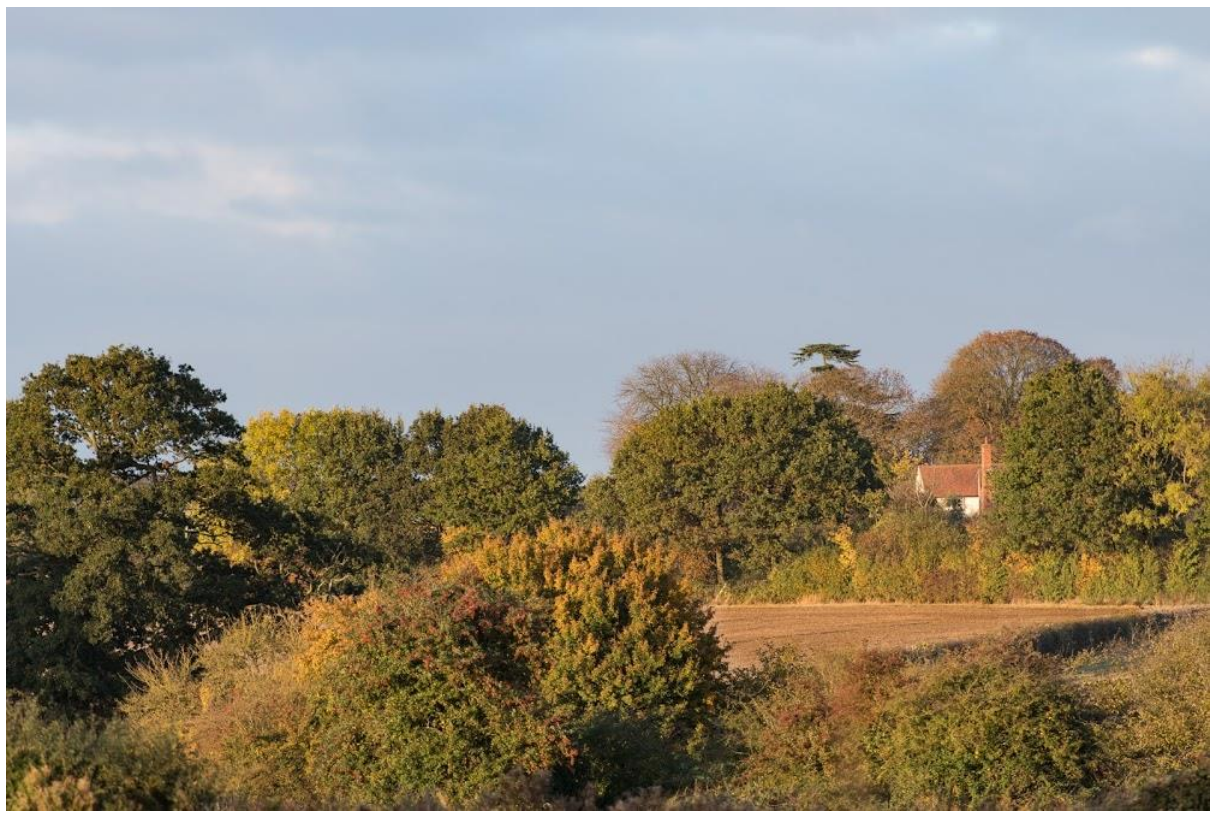
The sites were proposed by land owners themselves [CAUSE]

To add to these three "garden communities" already in the north Essex pot, a fourth is now being promoted, the 15,000-home Monks Wood adjacent to Coggeshall. The authorities' obsession with very large, stand-alone settlements means that this equally unsustainable proposal must be treated seriously.