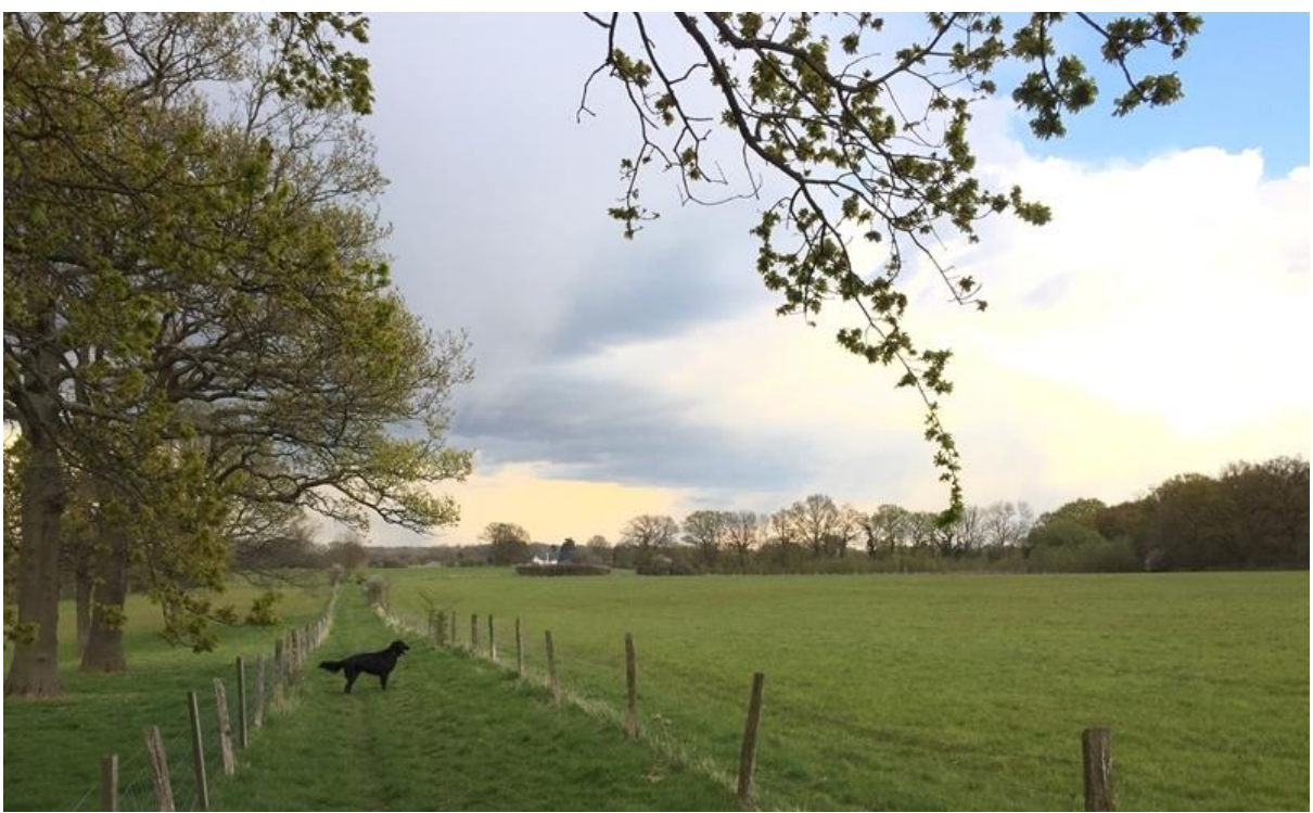
Tandridge has the highest proportion of green belt in England [Tandridge Lane Action Group]

As the Council has itself admitted, these circumstances "will not be repeated". Those sites will not fall vacant twice! But the OAN would force the high level of building to continue. Since Tandridge has very low population growth, some 90% of the houses will be bought by people coming into the area, rather than meeting local need. And since it has limited employment, and little prospect of attracting new jobs, most of the new residents will commute out of it to work, especially to London.