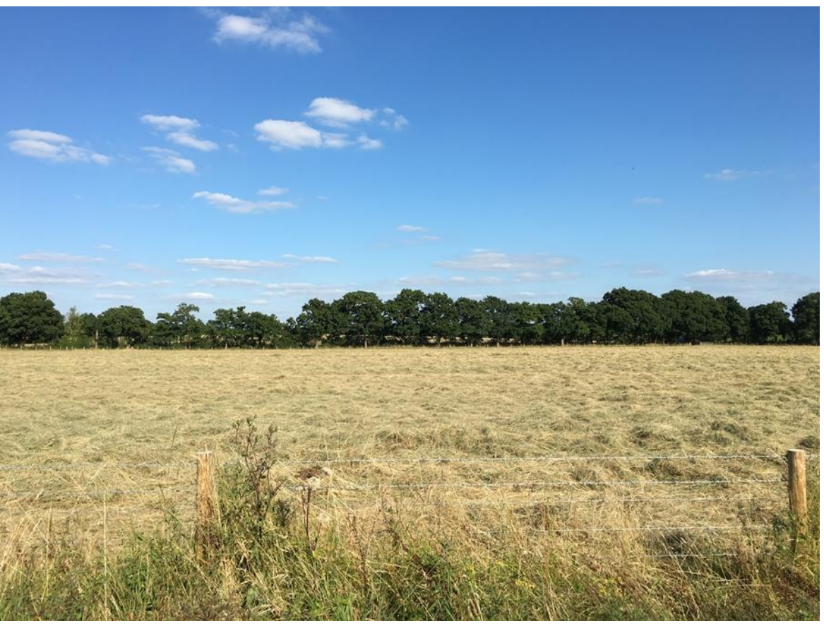
The nation needs more homes, but not big, expensive, green belt homes [Tandridge Lane Action Group]

The nation badly needs more homes - but it does not need more big, expensive, houses sprawling across the green belt. It needs sustainable, denser development on brownfield land, near employment and good public transport – all of which are elements of Smart Growth.