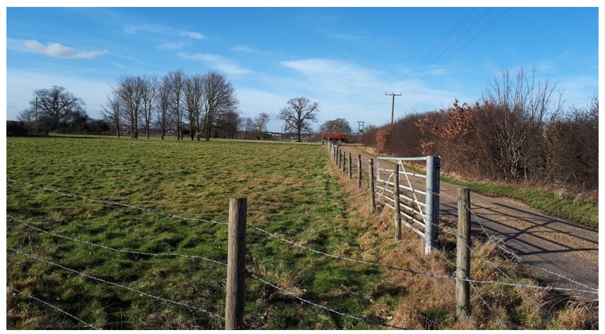
Huge areas of farmland are threatened with destruction [Hands Off Wivenhoe]

The case against garden communities was set out in detail in our report last year<sup>3</sup> and can be read there. In summary the objections are:-