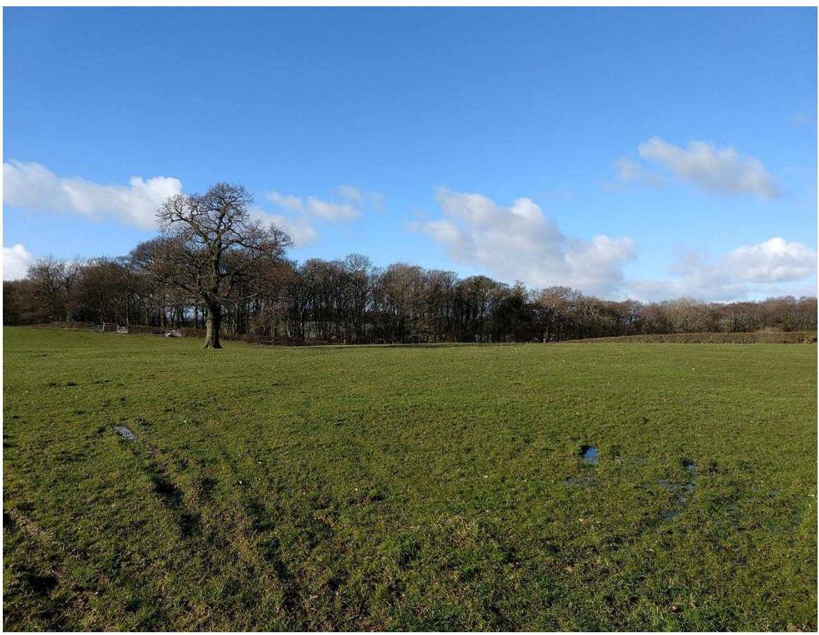
Land between Galgate and Burrow [CLOUD]

The construction of a slip road from Junction 33 across the flood plain of the Conder risks making matters even worse. The planners claim that addressing flood risk to the Garden Village from Burrow Beck would also reduce risks for Galgate is not credible. Galgate is setting up a flood resilience group to which CLOUD will be affiliated.