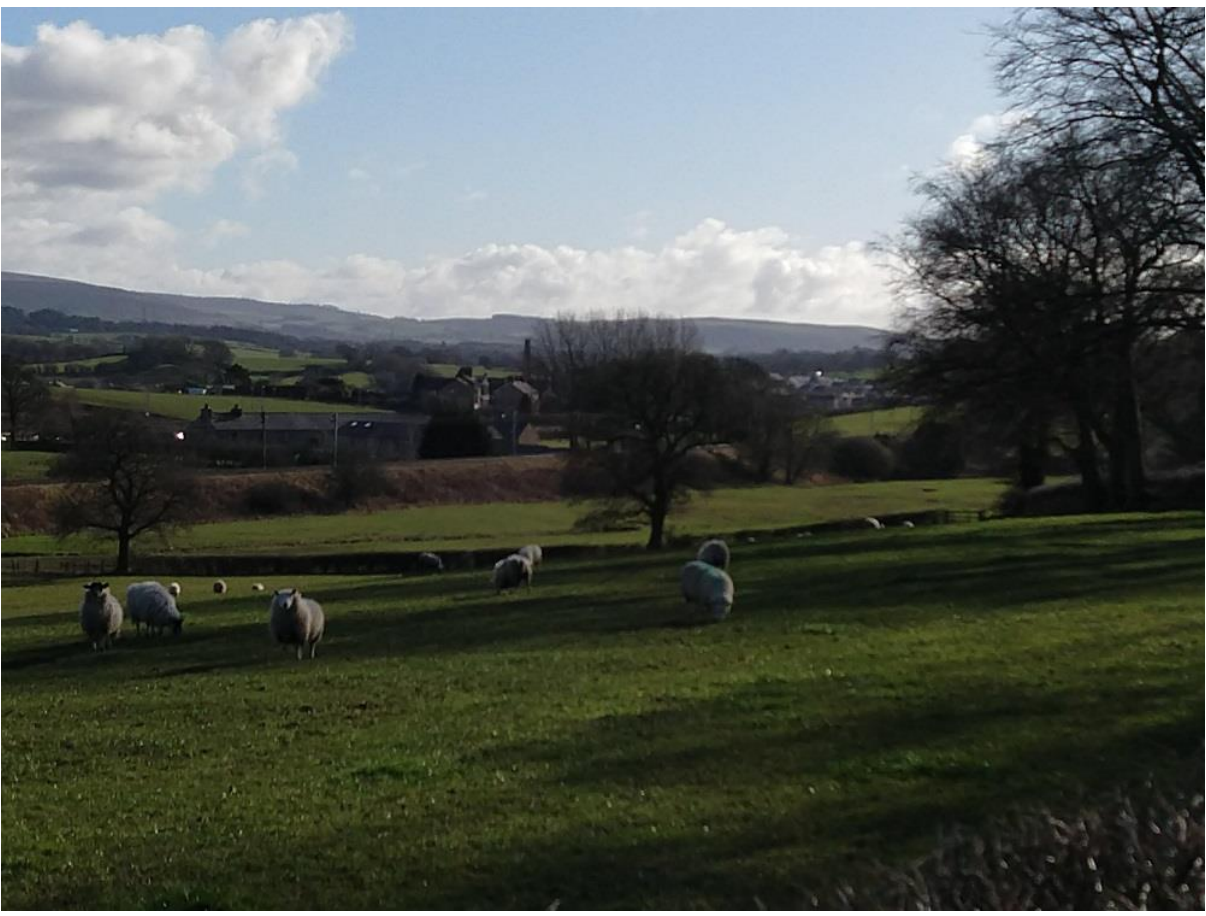
To be lost forever? [CLOUD]

the 6 April deadline. A planning inspector will be appointed to review the plan, and any objections will be aired at public hearings currently expected in the autumn of 2018.