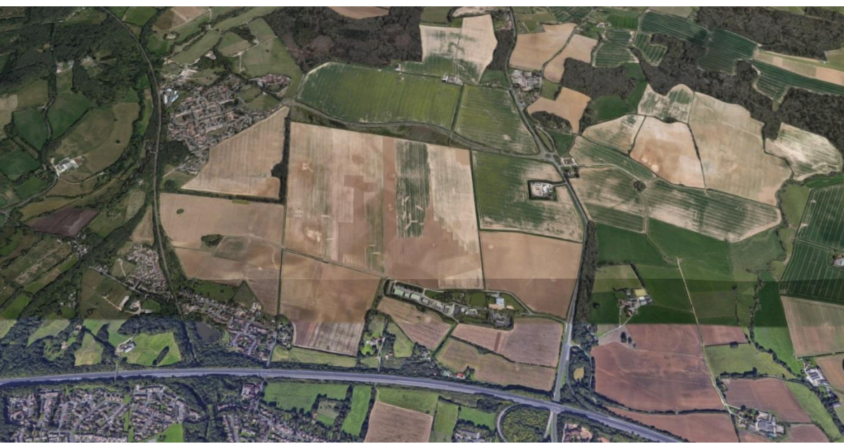
The Welborne site