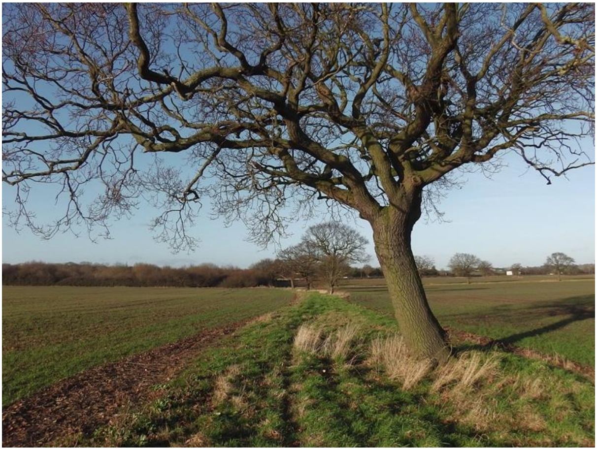
Productive farmland threatened by the garden village development [R.A.I.D.]

The land under threat is located between Brentwood and Basildon and the Council stresses its direct road links to the A127 which adjoins the northern boundary, as the A128 does the western. West Horndon is near the western boundary and Laindon is a little further from the eastern.