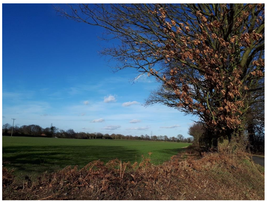
Protecting the countryside from development is a repeated theme [Hands Off Wivenhoe]

The organisations who have contributed to this report are not necessarily supporters of the Smart Growth approach, yet they are united by their opposition to the garden communities being imposed on them and by their commitment to sustainable development. But it is surprising how often the central concerns of Smart Growth are cited by the groups. Protecting the countryside from development, brownfield-first policies, transit-oriented (rather than cardependent) development and the need to make best use of existing infrastructure and to provide new infrastructure where it's needed are constantly recurring themes.