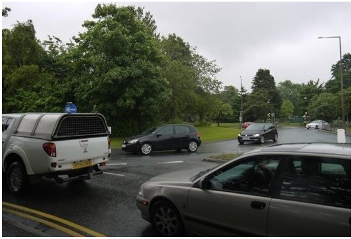
Pointer Roundabout [CLOUD]

There would be between 8,400 and 12,000 people of all ages in BGV, depending on how many dwellings are actually built. This would place an additional load on the transportation system. The Council has admitted that this has not yet been modelled, so the impact cannot yet be predicted. However, we know that the majority of journeys into and out of the Village - as it is in all predominantly residential areas - would be generated by journeys to and from work and to and from school, the "school run" potentially creating four journeys a day rather than two.