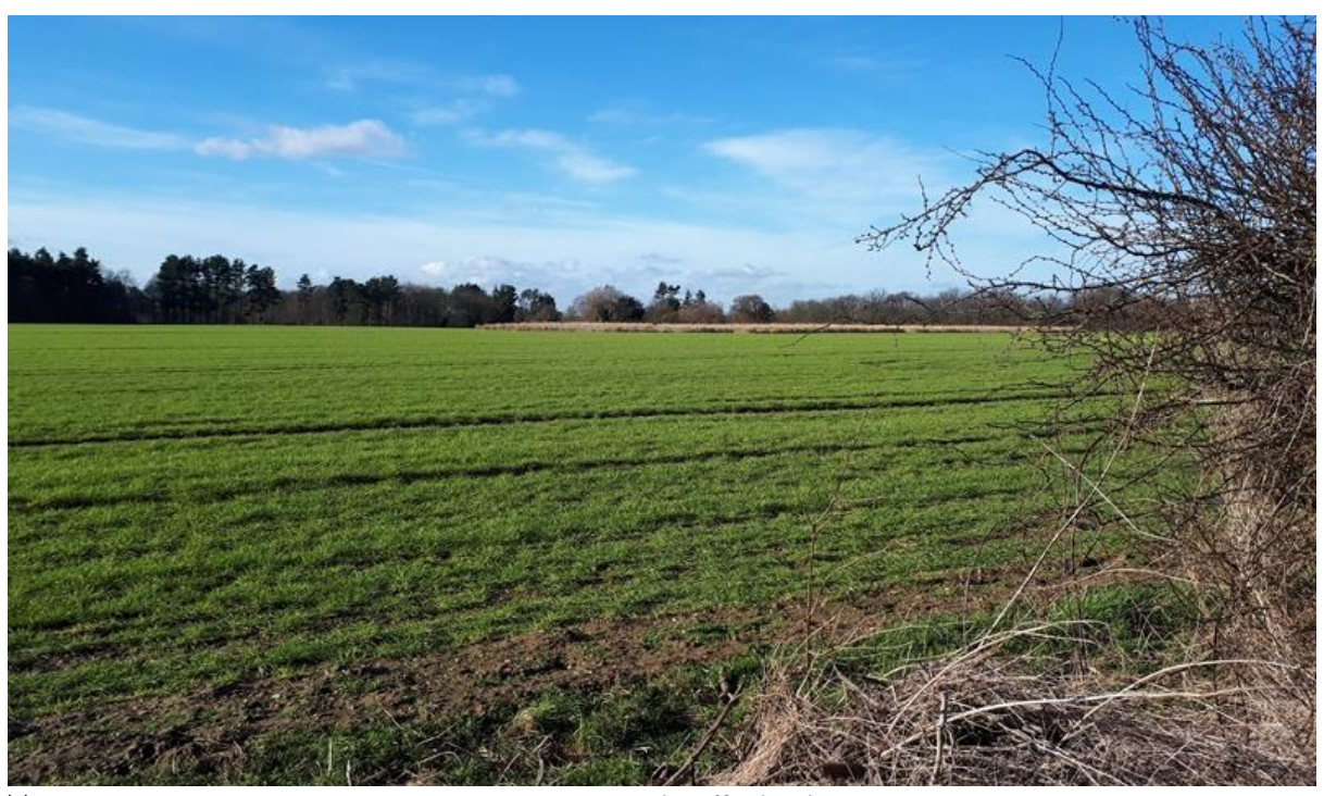
The plans threaten 43 square kilometres of land [Hands Off Wivenhoe]

The West Tey proposal would occupy up to 1703ha, East Colchester up to 816ha, Andrewsfield (West of Braintree) up to 996ha and Monks Wood up to 810ha of greenfield land. Most of the land under threat is highly productive grade 1 and 2 farmland. A number of hamlets and villages would be subsumed by the proposed settlements. The proposal would represent the wholescale urbanisation of a corridor of rural north Essex.