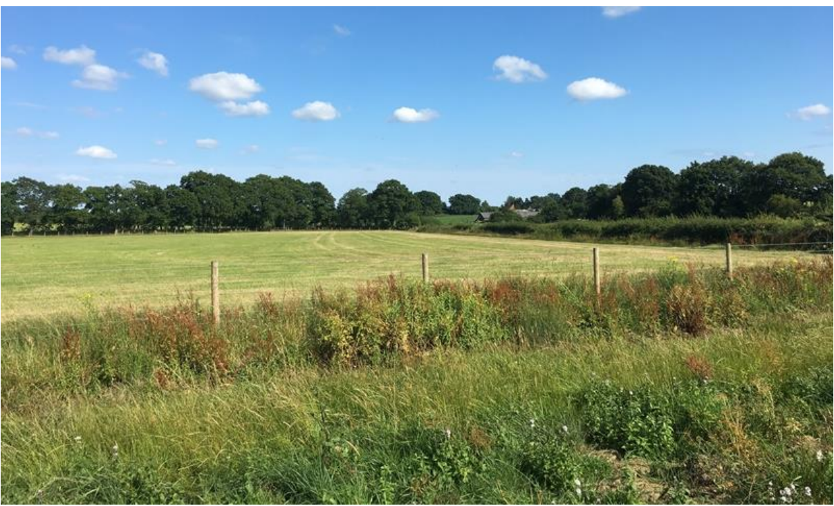
All three sites are designated green belt [Tandridge Lane Action Group]

All three sites are entirely within the green belt. Building what would amount, in size, to a new town at either location would set a dangerous precedent, paving the way for others to pockmark the supposedly protected designated area encircling London.