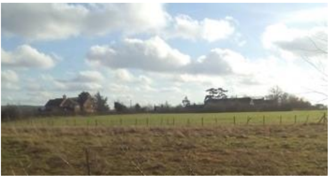
City Farm and its listed barns [EPIC]