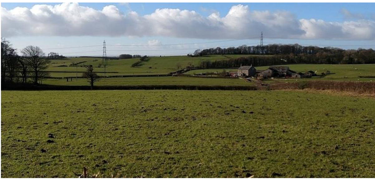
The land, looking towards Lower Burrow [CLOUD]

This is an enormous housing development. It would be nearly three times the size of Galgate (currently 1,200 houses). The land is farmland, and other amenities include the Lancaster Canal, ancient woodland and significant Roman archaeological sites at Burrow Heights. To be viable, the Garden Village would require extensive, costly new road links to provide access both under and over the West Coast Mainline railway to connect to the A6 and to the M6, plus a reconfiguration of M6 Junction 33, as well as a road crossing of the Canal.